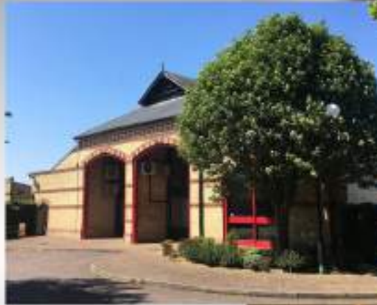
Unit 1a. 1,234 Sq Ft (Approx)

Unit 1a benefits from gas fired central heating, ample car parking, bicycle parking, kitchen, WC and showering facilities. Unit 6 boasts a large open plan space with a mezzanine, own kitchen & shared WC & Shower.