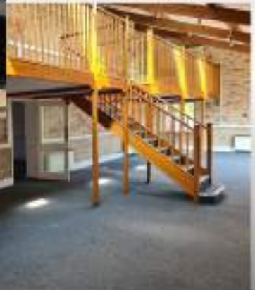
Unit 6. 1,158 Sq Ft (Approx)