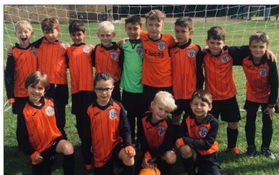
Taken in 2019, our U13s will be stepping up to 11aside next season.