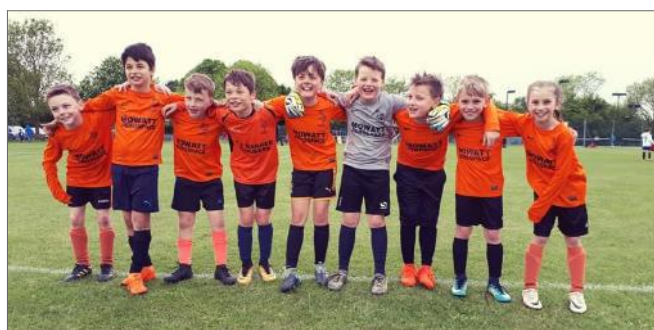
Our U15s 5 years ago, back in 2018.