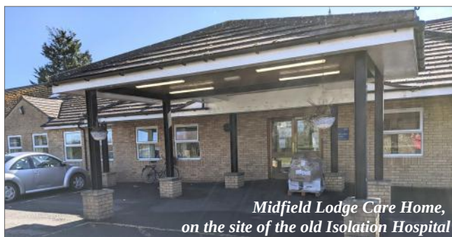
Midfield Lodge Care Home, on the site of the old Isolation Hospital