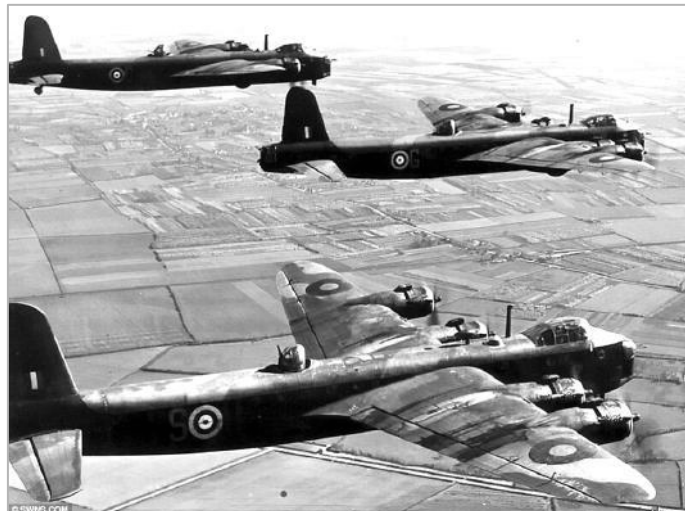
Stirling bombers pictured above Cambridge during WWII

On Saturday 14 March 1943 at 9pm, a four engine Stirling bomber crashed in front of our house! The exact location was in an L-shaped field which fronted Coles Lane and Croft Lane in Oakington. The field was part grass and part orchard, now houses.