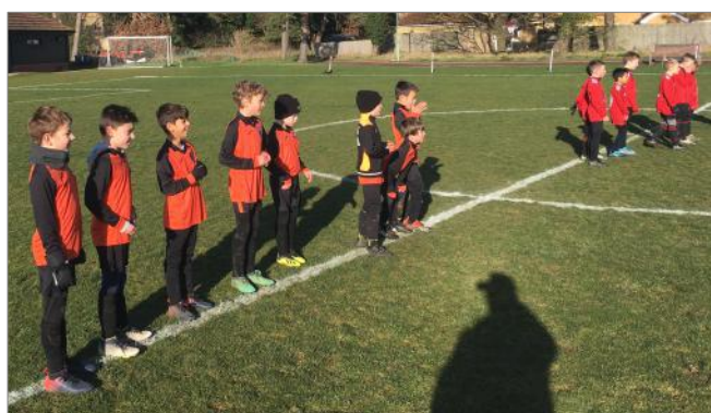
The Under 9s experiencing the tension of a penalty shoot out after their victory over Red Lodge