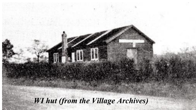
WI hut (from the Village Archives)